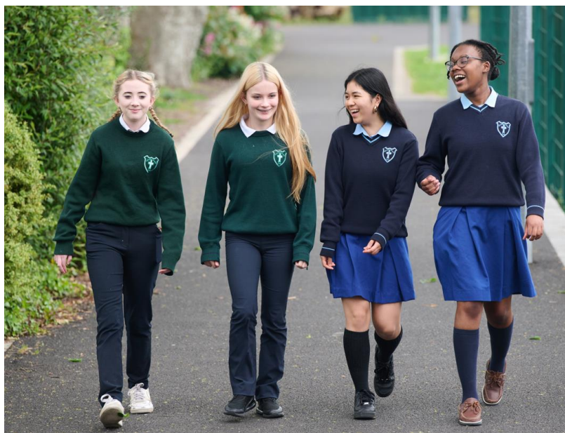
Junior and Senior Uniforms

Facial Jewellery is not permitted in school.